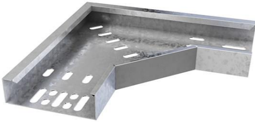
Illustration shown is medium duty