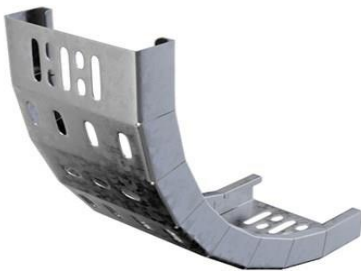
Illustration shown is medium duty