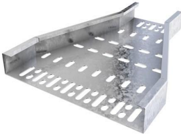
Illustration shown is medium duty